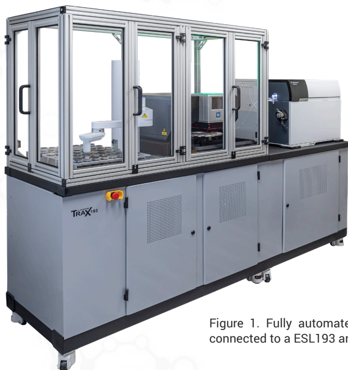
Figure 1. Fully automated LaserTRAX system connected to a ESL193 and Agilent 7900.